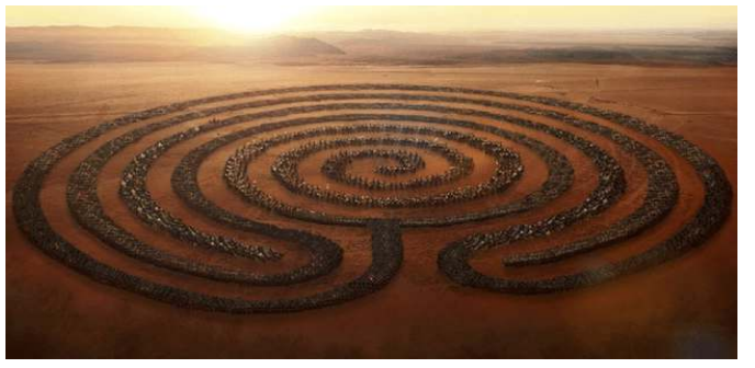
Figure 2: The Invincible Wheel Trap – Chakra Vyuha.